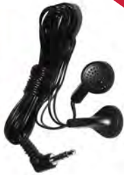
MP3 Audio Guide