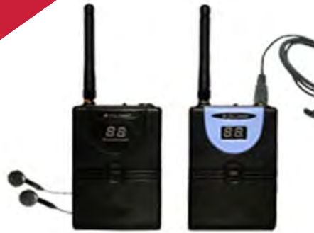
1-way - Tour Guide System